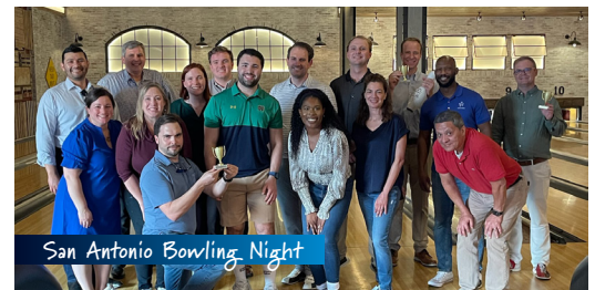
San Antonio Bowling Night

In addition to substantive work assignments, summer associates will have the opportunity to participate in a mock trial based on an active case, or a mediation seminar. Through these experiences, summer associates receive practical instruction designed to make young lawyers better advocates for their clients.