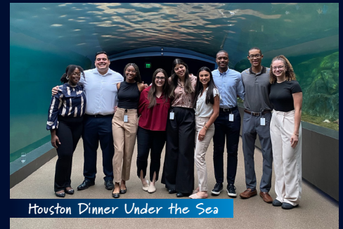
Houston Dinner Under the Sea