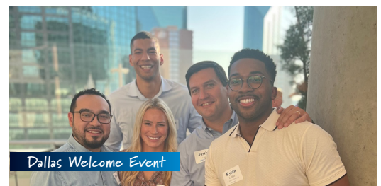
Dallas Welcome Event