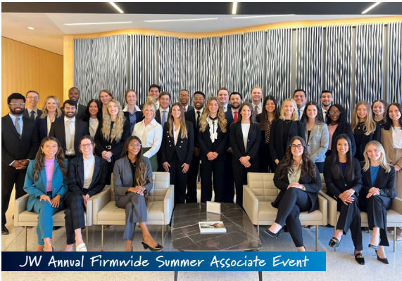
JW Annual Firmwide Summer Associate Event