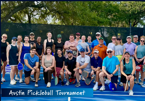
Austin Pickleball Tournament