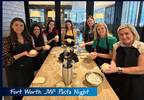
Fort Worth JW² Pasta Night